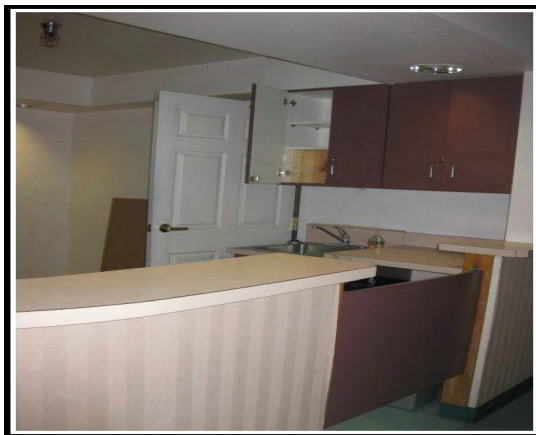
Before Common Area renovation