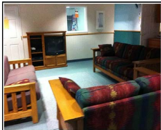
After renovation project